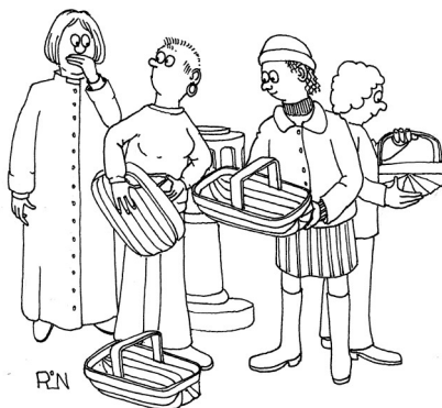
Shirley caught the flower ladies red-handed, dealing trugs

01884254378. sallynevillemundy@hotmail.com