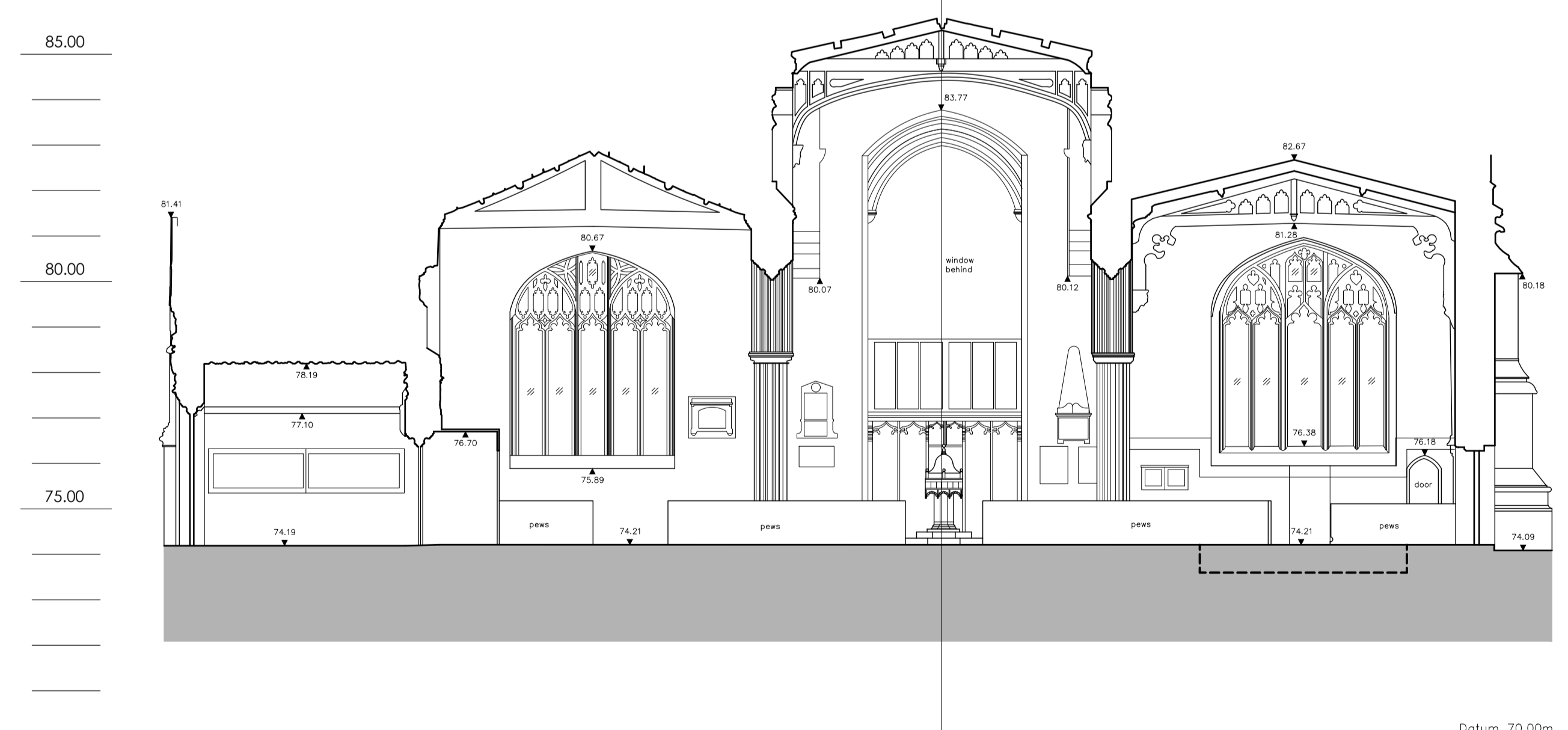
SECTION B | AS EXISTING - SCALE 1:200