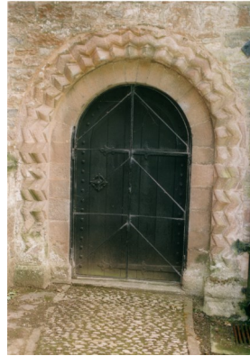
The Norman Doorway (North entrance)

The Lectern was presented in 1875 and is very handsome. Its decoration employs many symbols of St. Peter's including a fish, a key, a cock and a church